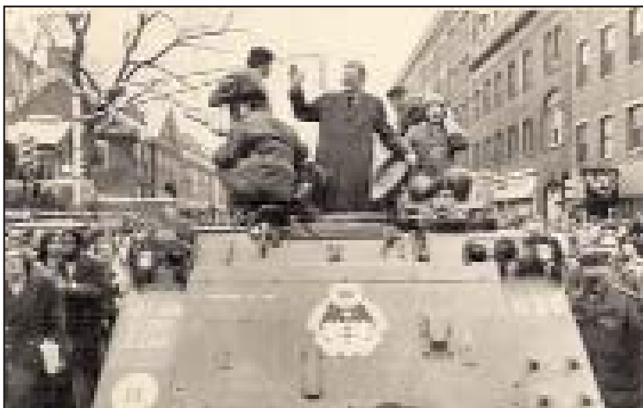
John Wayne in Harvard Square, Jan 15, 1974