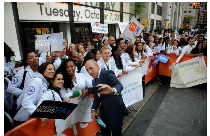
“NBC Today Show”

PAs appeared on TV shows (the NBC “Today Show” audience); shared photos on Facebook and Instagram; tweeted thousands of messages of congratulations on Twitter; issued press releases; were interviewed on radio shows; and were honored with proclamations of praise from city mayors, state governors, and local, state and national legislators.