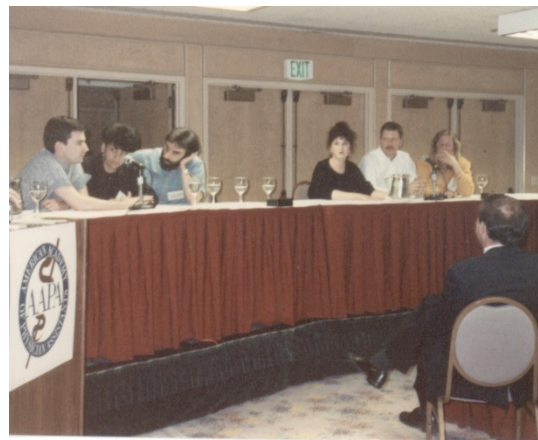
Student Teams Consider Answer