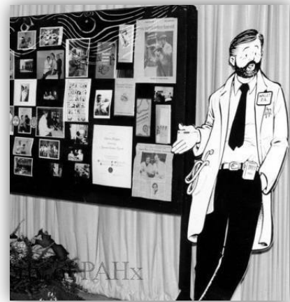
Chipper at AAPA Conference Nashville, TN 1992