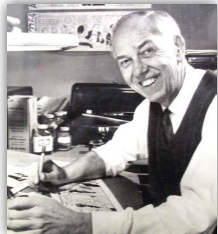
Cartoonist Dick Moores

A graduate of the Chicago Art Academy, Dick Moores began his cartooning career as an assistant to Chester Gould on Dick Tracy during the early 1930s. After several successful ventures of his own, he joined the Disney Studios in 1942 working on several comic series and animations. In 1956, Frank King recruited him to assist with Gasoline Alley , a comic strip that King introduced to the public in 1918. This comic focused on the country's fascination with automobiles. The characters of the strip aged in "real time" - growing up, marrying, parenting, and dying as the years went by. By the time King retired from doing the Sunday strip in 1951, Dick Moores was groomed to take over. Like all Americans, the Vietnam conflict affected the lives of the characters in Gasoline Alley. Chipper, the Wallet's son, enlisted and became a military corpsman. Upon his