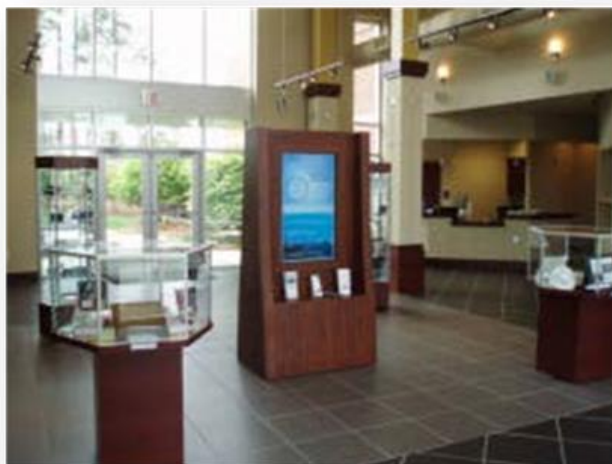
Lobby Display Area