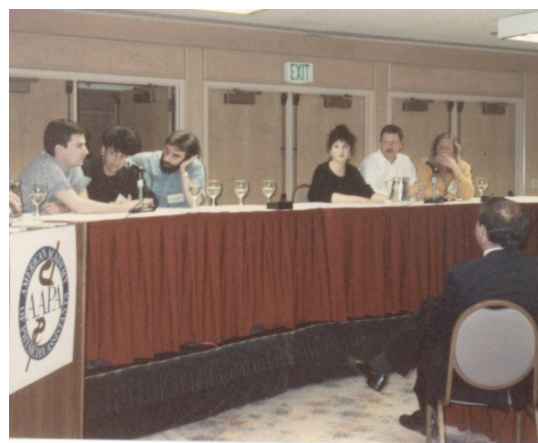
Student Teams Consider Answer