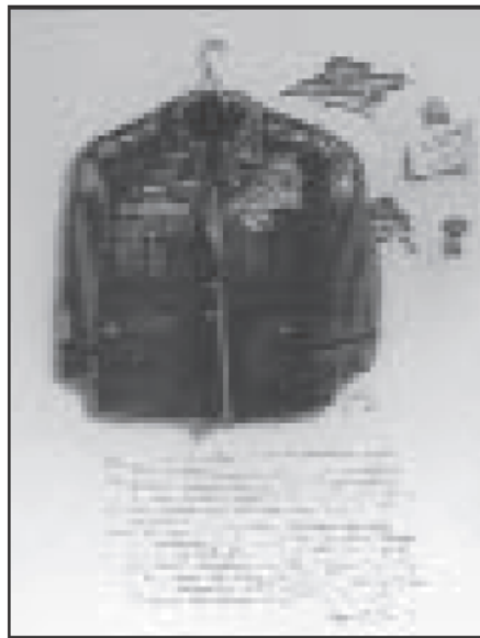
Uniform by George L. Skypeck, III

Sky is one of America’s most prominent military-historical commemorative artists. He is a combat-wounded, disabled Vietnam veteran