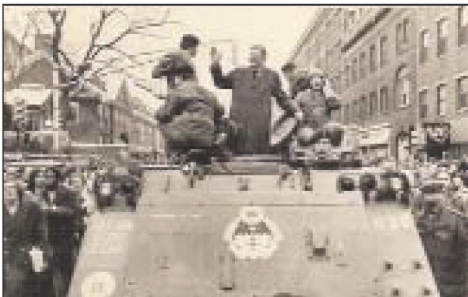
John Wayne in Harvard Square, Jan 15, 1974