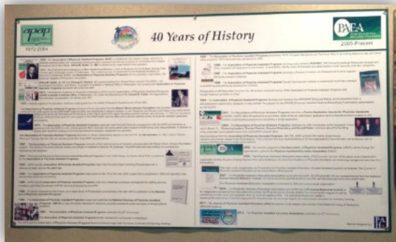
Timeline of events throughout PAEA history displayed at the Annual PAEA Meeting