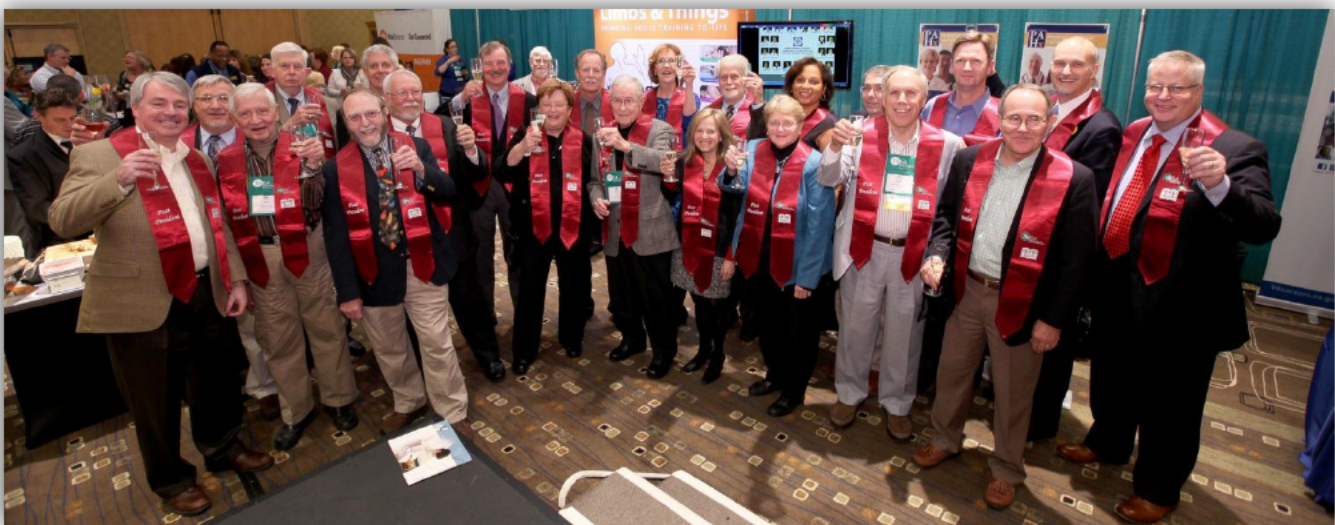
Past Presidents of the PAEA toast to 40 years of PA education at the Annual PAEA Meeting in November

participants entered the ballroom for the opening plenary session, projected onto the jumbo screens at the front were photos of past meetings and social gatherings over four decades of Association history.