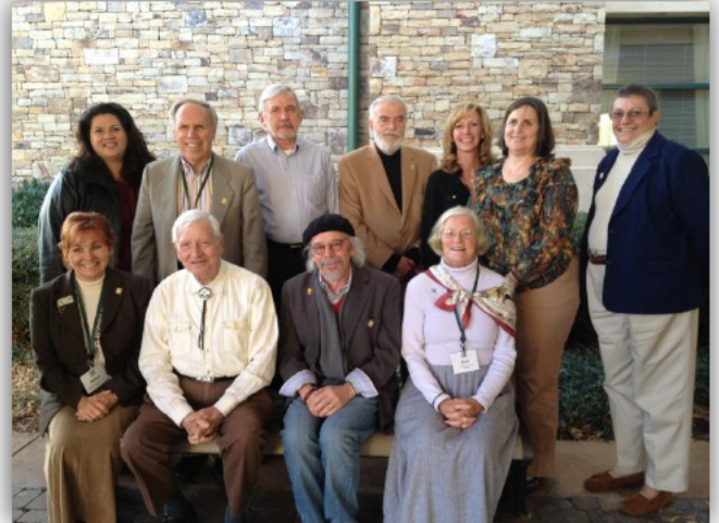
PA History Society Board of Directors

A great deal of time was spent reviewing the Strategic Plan. The Society has made significant progress during 2012. The Trustees look forward to significant further progress during the New Year.